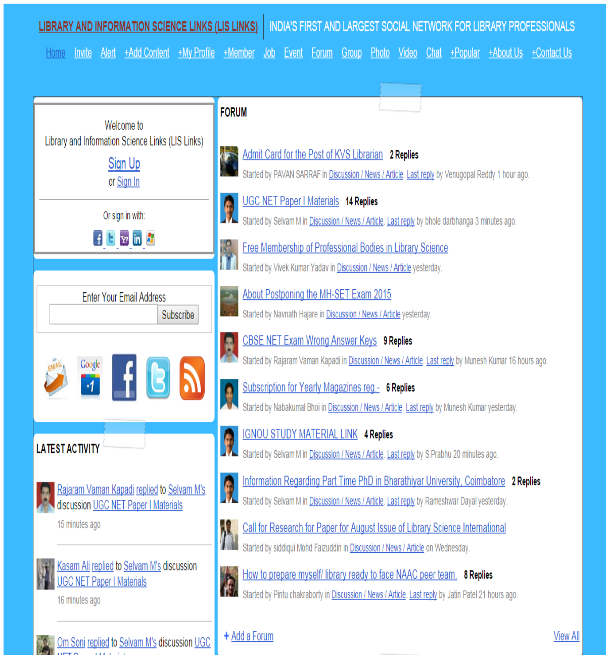
Fig.1: LIS Links ( http://lislinks.com ) Home Page as on August 20, 2015

The administrators of the website continuing their work as a professional obligation, as and when new technologies are emerged the chief administrator immediately integrates it to the website. The whole website is also updated continuously. The news stories, along with original writing, interviews and reviews, are updated frequently, usually 7 days a week.