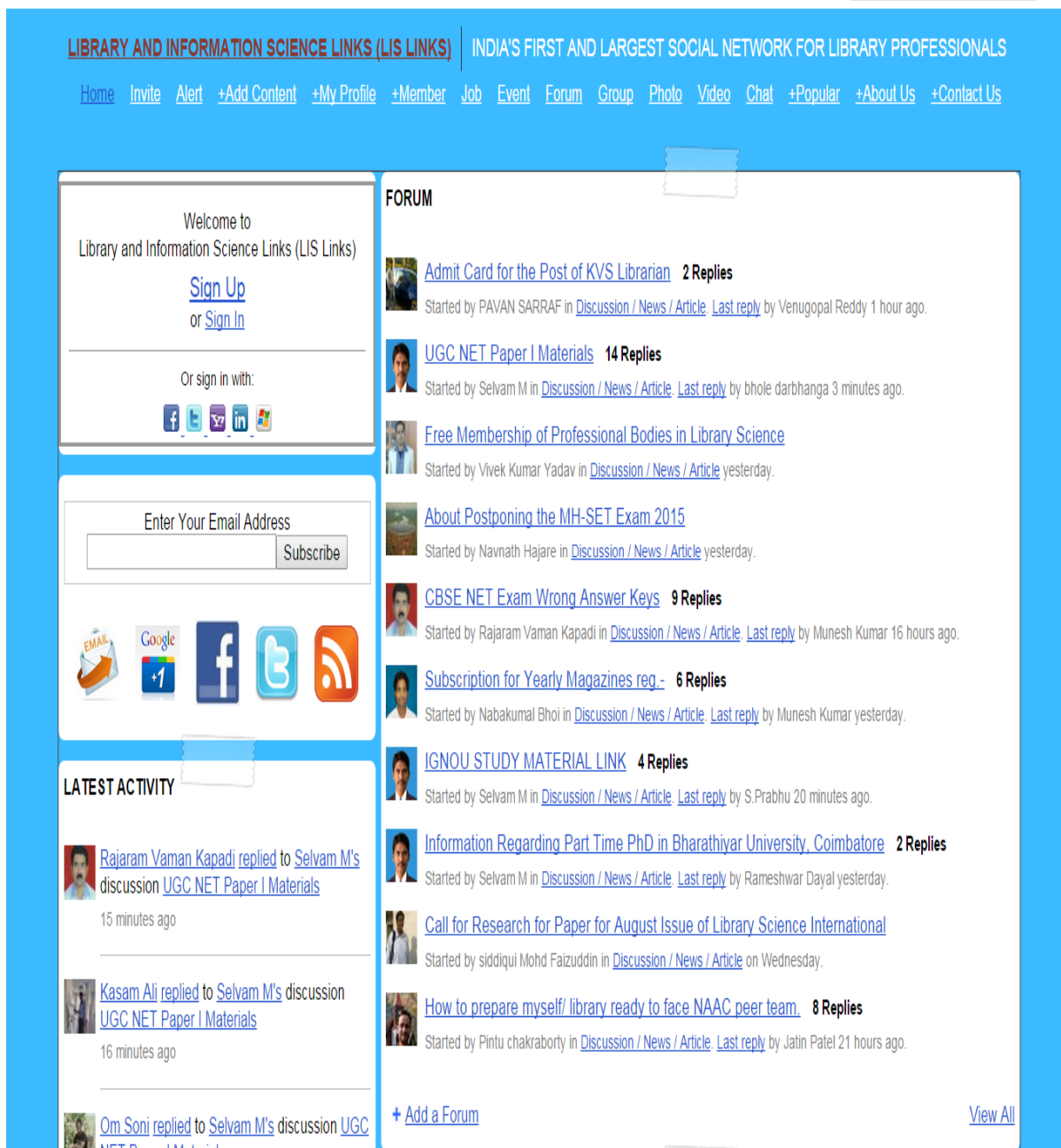
Fig.1: LIS Links ( http://lislinks.com ) Home Page as on August 20, 2015

The administrators of the website continuing their work as a professional obligation, as and when new technologies are emerged the chief administrator immediately integrates it to the website. The whole website is also updated continuously. The news stories, along with original writing, interviews and reviews, are updated frequently, usually 7 days a week.